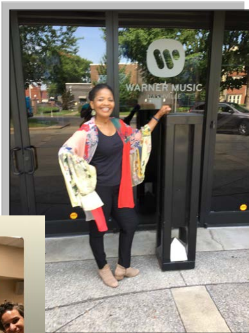
Warner Studios Nashville c/o City of Hope 7-2018