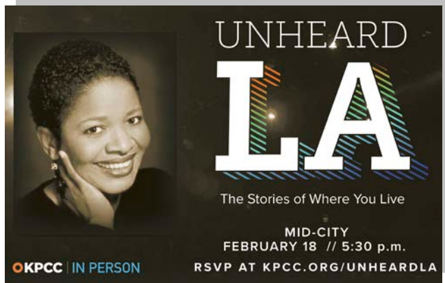
KPCC Unheard LA Speaker 2-2018