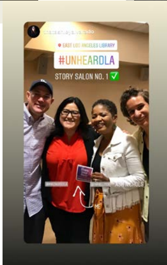
KPCC Unheard LA Story Salon 7-2018