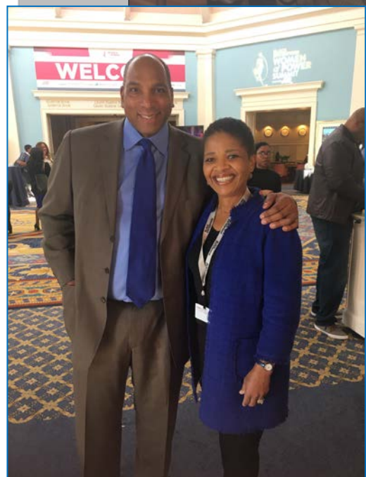
Black Enterprise Women of Power Summit 3-2018